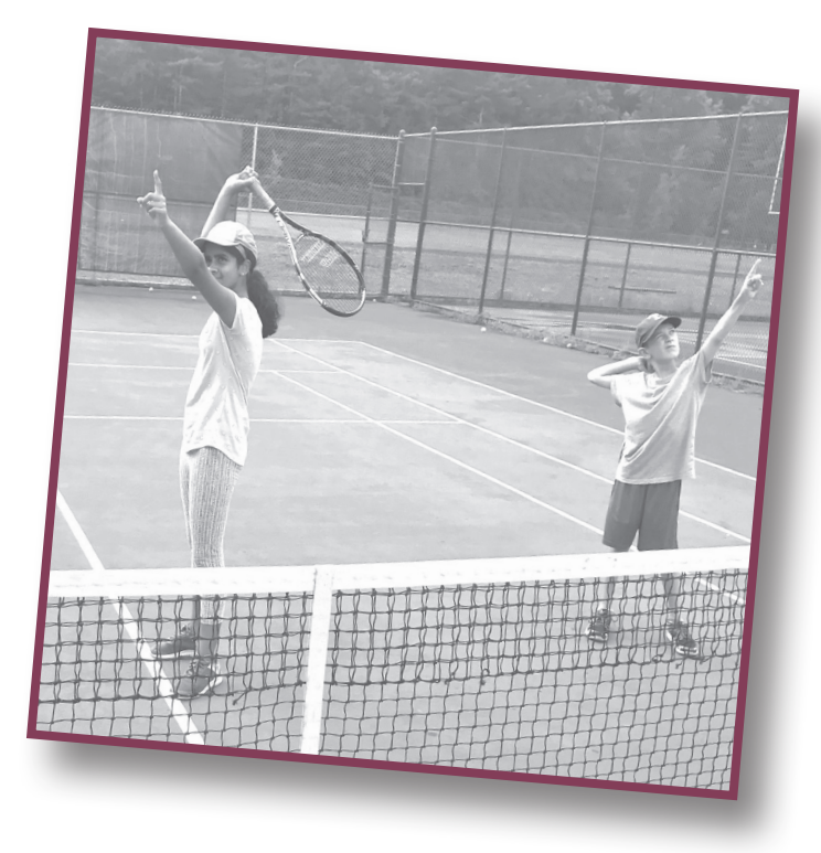
MLTC participants are in trophy pose position practicing their over-heads.